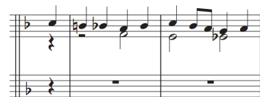
Toccata 3 b.21