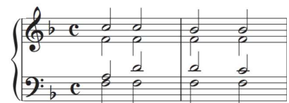
Toccata 6 b.1-2