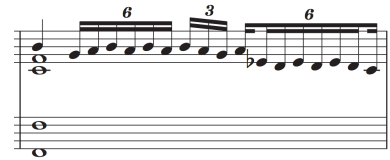
Toccata 6 b.48