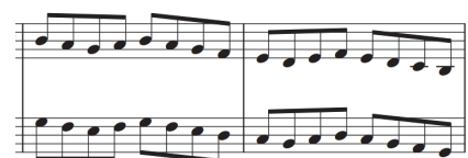
Toccata 7 b.34-35