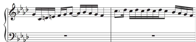
Toccata 1 b.81-82