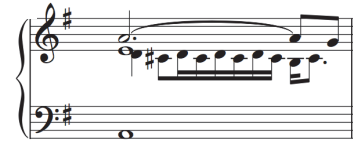
Toccata 4 b.31

The following work is an effort to apply a method of transcription, the most complete possible, in what regards the study and execution of Kapsberger's Toccatas for Lute.